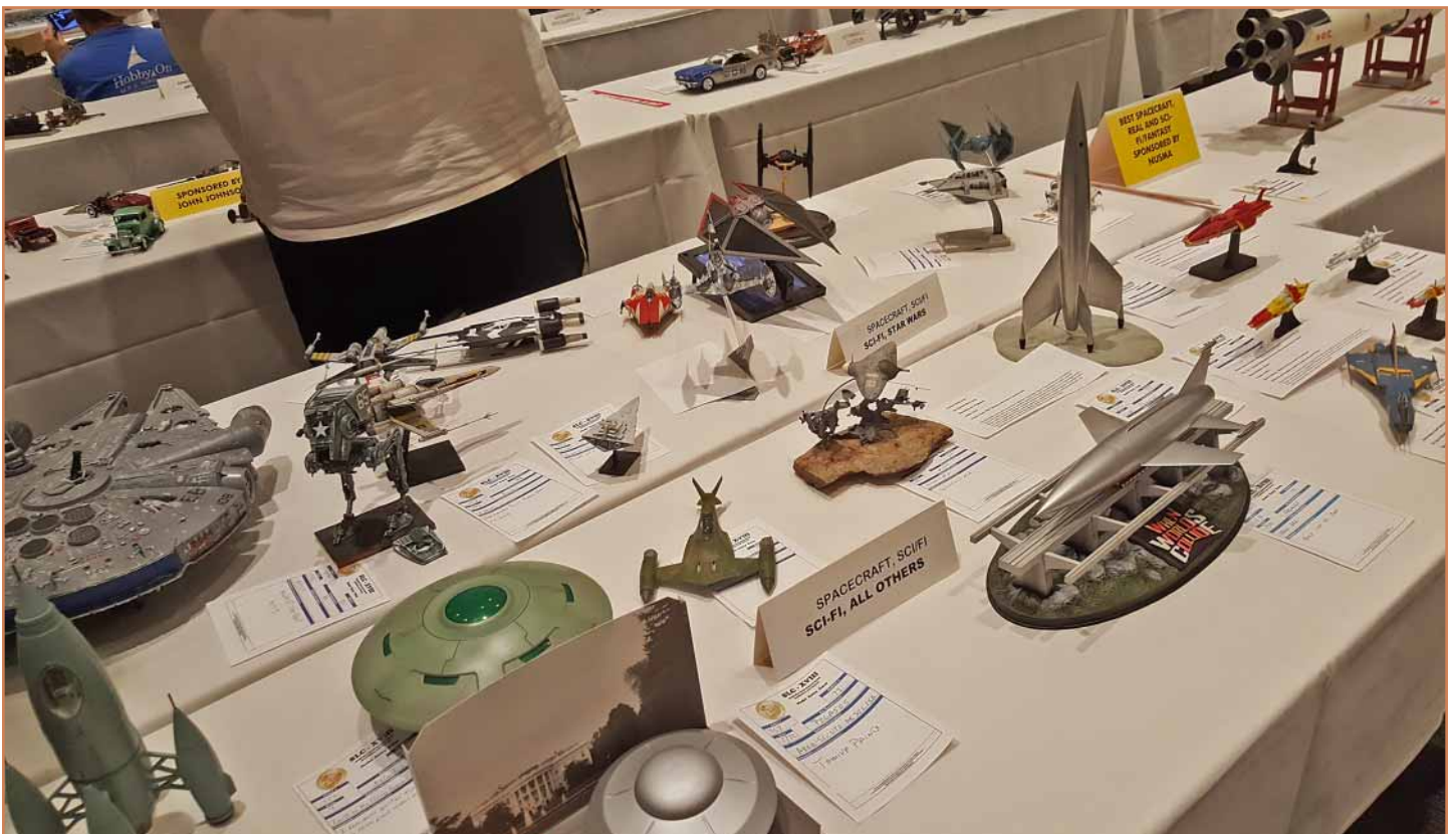
Below: More Sci-Fi than usual