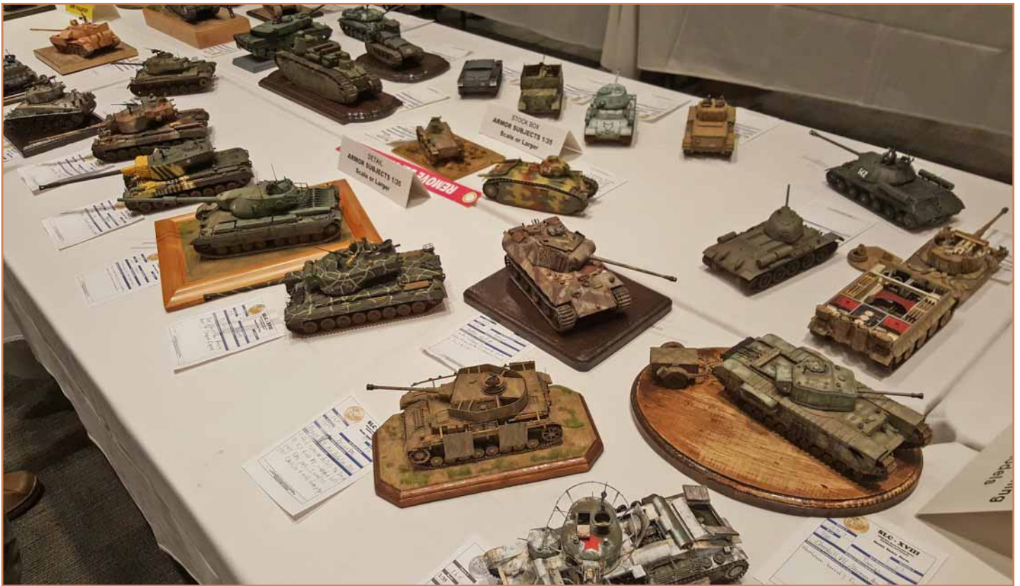
Above: As always, lots of armor.