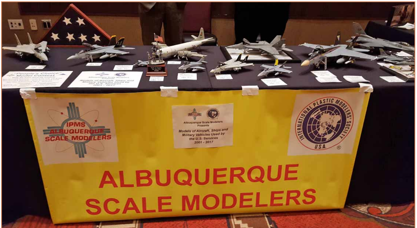
ASM's model display at the 2017 Folds of Honor Patriot Gala on September 23, 2017. The display had forty total models.

New Mexico Folds of Honor website: https://newmexico.foldsofhonor.org