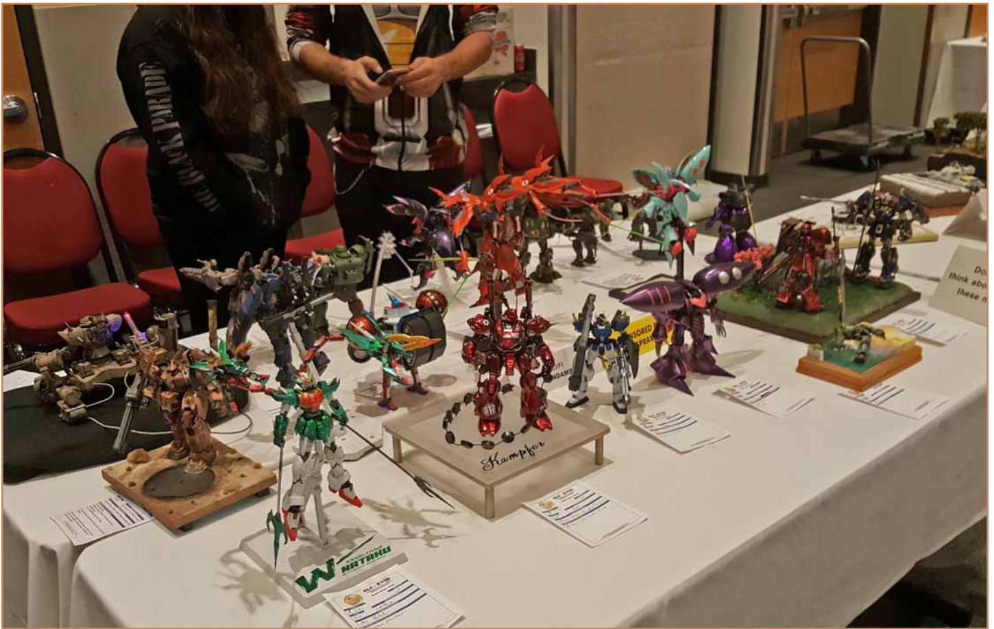
Above: Largest Gundam competition they've ever had Below: Judging in progress