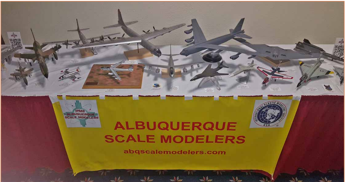
Following images: Test aircraft (1947 – present), the Korean War, Viet Nam, Strategic Air Command, Air Defense Command, Operations Desert Shield and Desert Storm, and then Operations Enduring Freedom and Inherent Resolve. The far right end had several models from the New Mexico Air National Guard “Tacos.”